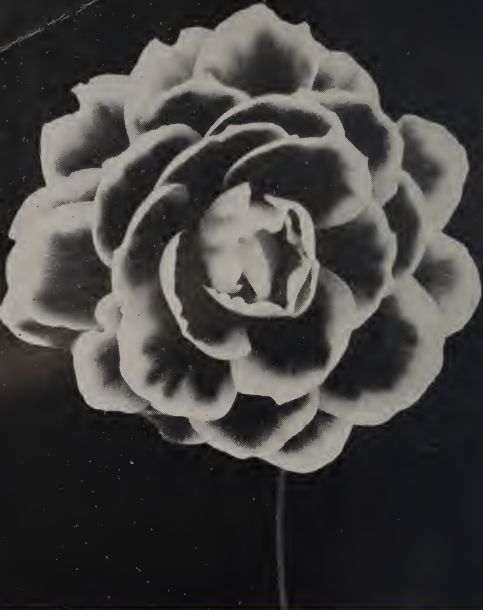
MARMORATA Deep Rose mottled on White